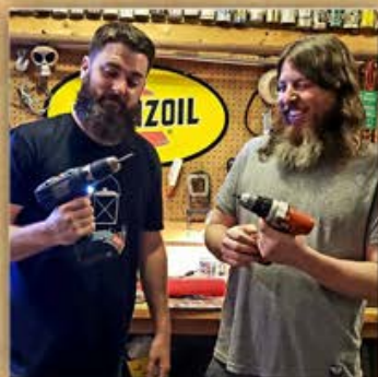
Local Favorite DIRT FLOOR RAMBLERS 1:00 p.m. - 3:00 p.m.